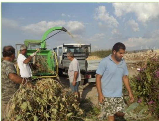
The President of Kouklia Community and colleagues working with the wood shredders.

“Our community has made sustainability a standing agenda item on our agenda. Already more than 50% of our energy production is from renewable resources, compared to the overall EU Member State target of 20% by the year 2020. During my visit to the Netherlands entitled “Opportunities for new member states”, the partners were shown Dutch footpaths and cycle tracks made from local, natural products - in this case sea-shells - instead of asphalt. I discussed whether our green, organic, agricultural waste viz. trimmings could be used as an alternative viable footpath surface to the clay we currently use. Following a positive response and realising this would also improve our waste management policy, the community decided to invest €20000 in a wood-shredder earlier this year. After several months of operation, the shredder is producing ca. 4t/hr of shredded material.