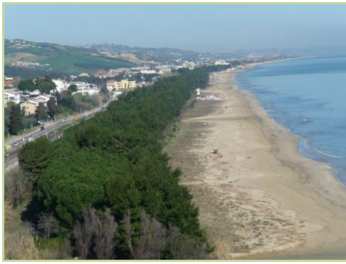
Teramo Coastal landscape, Italy

protected area could be an important strategy for inclusion in the management of the Tagus Estuary. This will allow fishery activities in a buffer zone around a maritime protected area in a way that is attractive to, and will involve, the fishermen. At the same time that those fishermen using the territory, will respect, and themselves supervise, the protected area and its limits. The certification of the fish caught is an incentive because it can be sold in the market with a quality brand. We think that this can be a measure that will support us in the implementation of marine protected areas. This strategy also meets what we also plan to develop: a marketing brand for the Tagus Estuary, as a sustainability brand”.