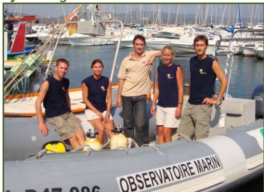
SIVOM Marine Observatory team