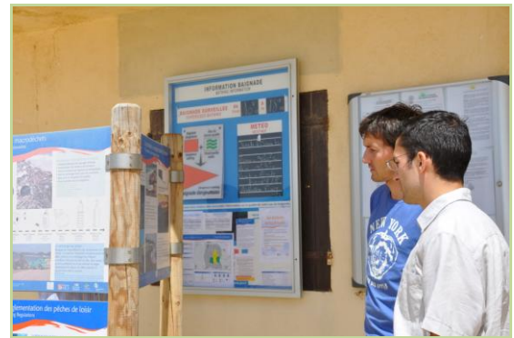
Bathing Water information panels produced by SIVOM Marine Observatory and displayed in the Littoral des Maures, France

Also, following the best practices shared, namely in Cavalaire sur mer meeting, in France, ARH Tejo has attended the discussion and presentation of the bathing water profiles and the work that was being carried on as presented by SIVOM Marine Observatory. Being ourselves preparing our own “beach profiles” (a demand from the EU Bathing Water Directive) this was of special interest! The way our French colleagues proceeded has, for sure, inspired our own work, and ARH do Tejo displayed, in the beginning of the bathing season of 2011, on the internet and on the beaches, the bathing water profiles of the 92 maritime beaches under its jurisdiction area, in a very similar way to SIVOM. Going one step further, ARH Tejo has developed an Alert system as part of a Pilot project that is being applied in some of our most urbanised beaches, in Costa do Estoril . This project includes a warning alert when the climatic conditions cause an extreme situation where the coastal streams, flowing through an urbanised basin, can create a short event of pollution of the bathing water. It also combines the information coming from a model that makes a daily forecast for bathing water quality and the risk for the bather, thus allowing necessary measures to be taken to safeguard the public health and also to control/eliminate the pollution situation.”