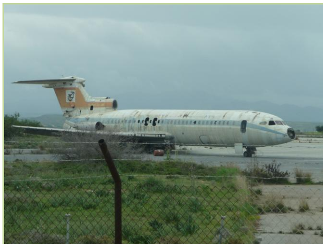
Nicosia, view of the buffer zone patrolled by the UN at the occasion of the inter-regional exchange visit to the occupied territory in Cyprus.

“The partners witnessed local organisations from across divided Turkish and Cypriot communities that have found ways of working together, building networks, co-operating on issues of common interest for positive change regardless of the political constraints, during a visit to Cyprus.