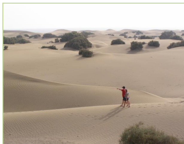
Maspalomas dunes natural reserve, Gran Canaria

It can develop specific planning or management proposals and agreements, collaboration between administrations, hard and soft constructions, etc. The effectiveness of the consortium has been high. In the first six months of existence: it has developed a Plan for the restoration of the tourist areas, the first (out of two) objectives to achieve. I felt very strongly that similar areas in Teramo Province can be served the same way and when I returned to Italy I immediately began to see if my colleagues from different departments and bureaus were interested to set up a similar instrument. The response I got was extremely positive and I have been given a green light to form a similar consortium to develop those areas in the province required regeneration”.